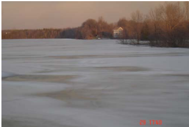
dec 29 snow melt- rowing hut in background