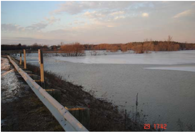
Dec 29,2008 snow melt - from the dam facing the overflow pond