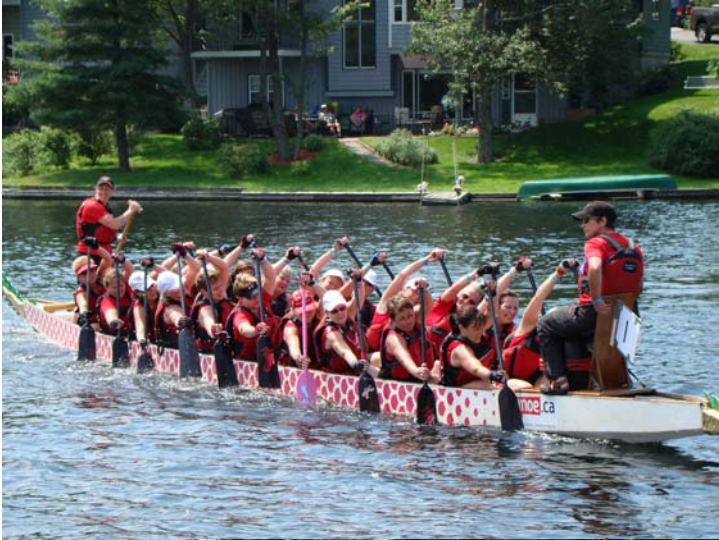
And the winners are.....Stratford 2008