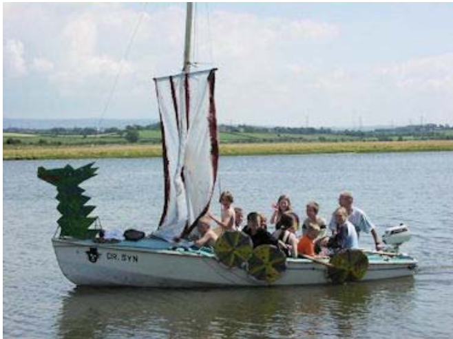
Finally, a way to combine our sailing club and dragon boat clubs

It is not too soon to schedule your time to help with the upcoming Open House. Volunteers are needed for a variety of tasks - greeting guests at the gate, kitchen duty, providing rides in sailboats, managing club and sailing school displays, organizing the people on the docks, preparing info packets for guests, and so on. A sign up sheet will be at the Fall Work Parties.