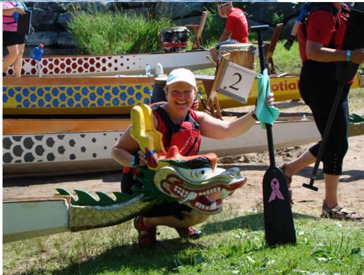
A pat for good luck - Halifax 2008