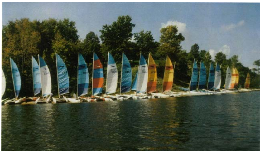
20 Darts lined up on the FYC shore for a Dart Nationals about 5 yrs later

The best turnout the Darts had though, was up at Pt. Clark on Lake Huron with 37 Darts racing on the Civic Holiday weekend of Aug 2000