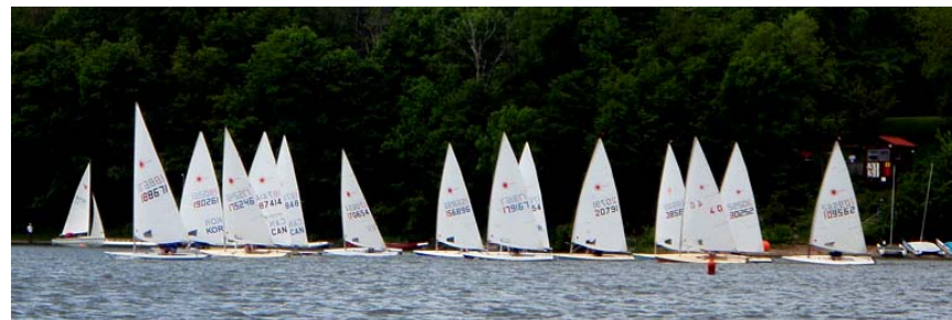
FYC 2009 Commodore Cup/ June Bug fyc.on.ca

To sum up the trip, it was very exciting and entertaining but if you join us next year be warned that nothing is cheap on the island.