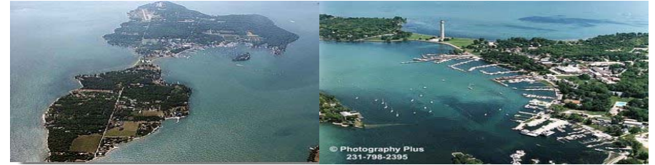
South Bass Island