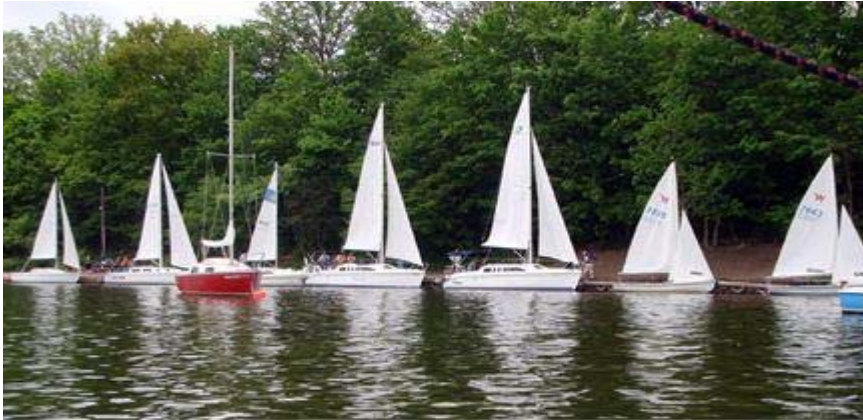
2009 Open House website photo