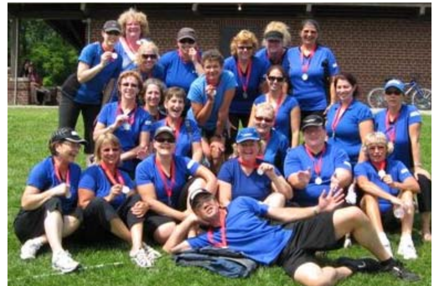
Waves of Fury our recreational team with medals at Woodstock

Visit our website for information: www.londondragonboat.com