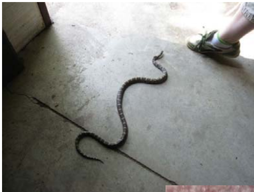
Recognize the chalet floor? Appeared to be a milk snake

Dock Spider or wolf spider on the carpet of the London DB dock