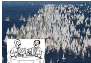
BEAT THE RUSH

Cocktails at 5:30 PM (cash bar) Dinner at 6:30 PM Program and Entertainment to follow